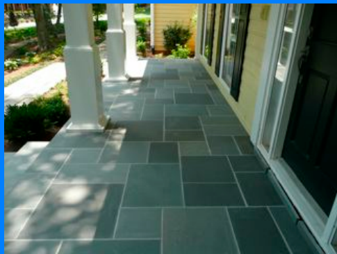
Blue Stone Front Porch